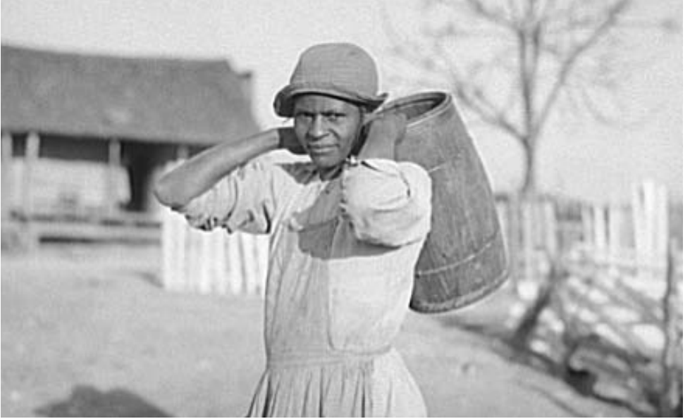
Carrying water. Gees Bend, Alabama. April 1937.