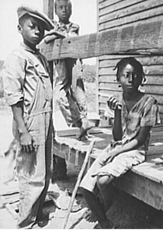
Mississippi Delta Children. Dorothea Lange, July 1936.

In these images, photographers Dorothea Lange and Arthur Rothstein captured poverty and desperation in the deep south during the Great Depression.