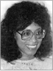
Mildred D. Taylor

Mildred Taylor (1943- ) was born in Jackson, Mississippi. Her father moved the family north to Toledo, Ohio, in the mid-1940s so that his children would not have to grow up in the segregated, racist society he had grown up in. While Ohio was not free of racism, Taylor's father believed the North would provide better opportunities and more freedom than the South. The family took yearly trips to the South to visit relatives. During these trips, the family faced racist policies Taylor was not familiar with in the North. They were barred from certain restaurants, they were allowed to drink only from water fountains for African Americans, and they were often harassed by the police. Despite these injustices, Taylor has fond memories of other aspects of the South, such as the sense of family and community she experienced there.