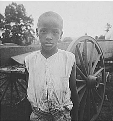
Young child on the Mississippi Delta.